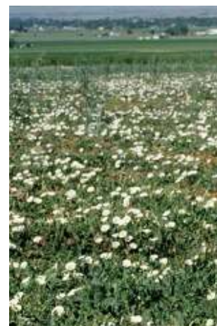
Figure 3. Crop yields can be reduced 50 percent or more where field bindweed infestations are dense.