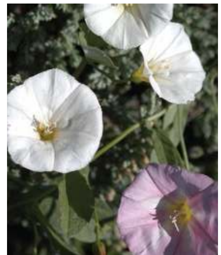
Figure 8. Blooming begins about 4 weeks after emergence in mid-spring and continues until frost kills plant foliage.

The bud or early bloom stage is the best time to spray field bindweed provided that the plant is not water stressed. Sugar movement to the roots is also high in fall as nighttime temperatures decline, so herbicide treatment of fall re-growth after harvest or tillage has resulted in long-term control of field bindweed. No herbicide will be effective if the plant has gone into dormancy or semi-dormancy due to drought, a killing frost, or other adverse growing conditions.