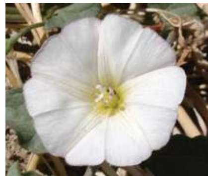
Figure 5. Field bindweed flowers, faintly scented, are about 1 inch in diameter and 1/2 to 1 inch long.

The leaf blade is usually blunt-tipped with a tiny point at its end. In some biotypes, the blade is sharply pointed. Leaves are dark green, vary from smooth to slightly hairy, and are usually 1/2 to 1 inch long, but vary in size depending upon the biotype and growing conditions.