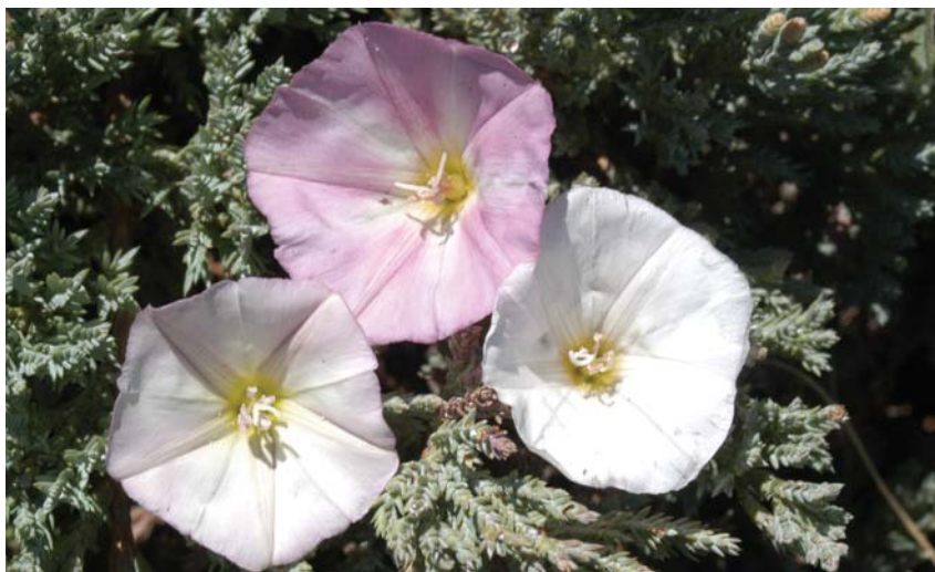
Figure 1. Field bindweed climbs upright plants, binding together all plants within a colony or patch. Creeping in every direction, it grows in circles. Pink to white floral petals fuse into a funnel shape.

Crop yields often are reduced 50 percent or more where field bindweed infestations are dense. Field bindweed has a deep root system that competes with crop plants for water and soil nutrients. Field bindweed vines climb on plants and shade them. They complicate tillage and harvesting by clogging machinery and entan-