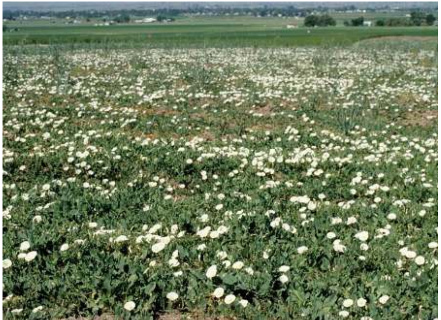
Figure 7. A pure stand of field bindweed can produce 22 million seeds (about 3/4 ton) per acre. Seeds mature about 3 weeks after flowers bloom, but have been known to germinate within 10 days after flowers open.

Since field bindweed seeds can survive in the soil for many decades, total eradication is not a realistic short-term goal where seeds lie dormant. However, with diligence you can eliminate field bindweed root systems by integrating the use of biological, mechanical, and chemical control agents into certain cropping or land management practices. When only the more easily controlled seedlings growing from seed remain, a field bindweed infestation causes negligible economic losses. The best control methods and materials depend on the size of the infestation and the conditions under which the weed is growing. Using a combination of