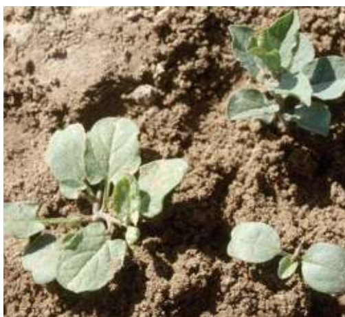
Figure 2. True seedlings, at left and lower right, emerged from seed. Upper right seedling comes from a root stock so it doesn't have cotyledonary (seed) leaves.