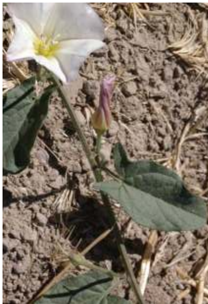
Figure 4. Leaves shaped like an arrowhead have two pointed basal lobes that extend at right angles to the leaf midvein.

Growth habit —Field bindweed is a perennial species with creeping roots and slender green, twisted, and vining stems that may grow as long as 6 feet. When other plant species are absent, field bindweed stems lie on the ground. Field bindweed will climb upright plants, binding together all plants within a colony or patch. Field bindweed normally grows in circular patches because it creeps in every direction. Cultivation or other types of mechanical or physical control may change this pattern by physically moving creeping roots.