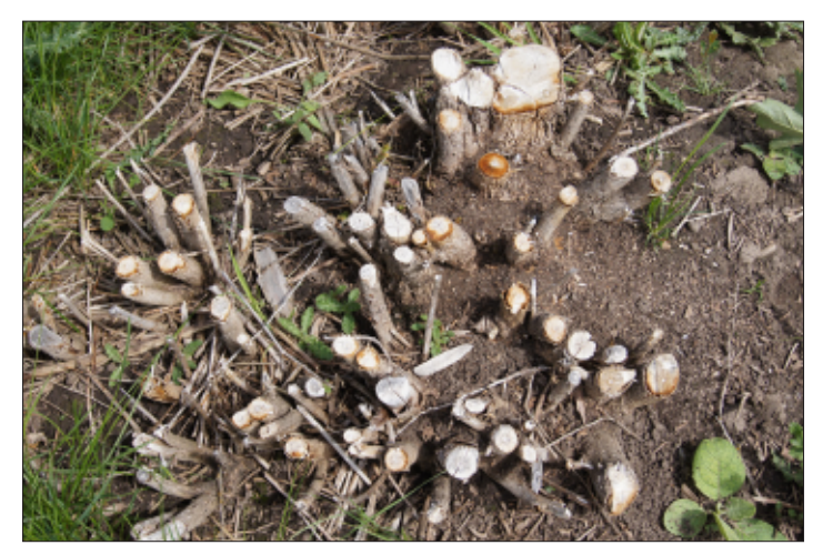
Figure 15. Absence of regrowth one year after cut-stump herbicide application.