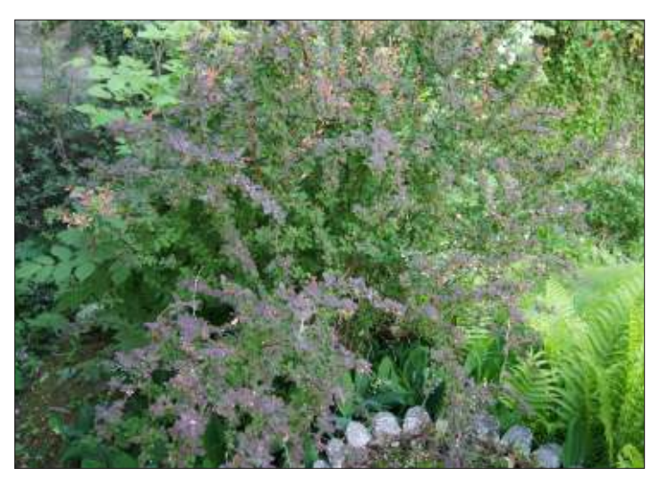
Figure 10. Natural growth shape of Japanese barberry, which are often trimmed into round bushes in landscaping.