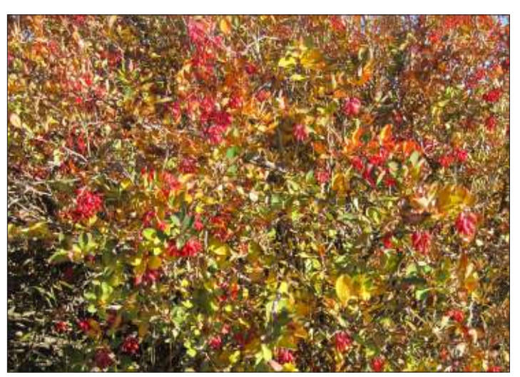
Figure 4. Large barberry bush showing fall leaf coloration.