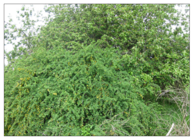
Figure 12. Untreated barberry (used for comparison with treated shrubs) located near other trees and shrubs.

Another uncut barberry shrub was set apart (but adjacent to other trees and shrubs) and left untreated, so it could be compared to treated shrubs to determine the amount of fungal infection developing throughout the year (Figure 12).