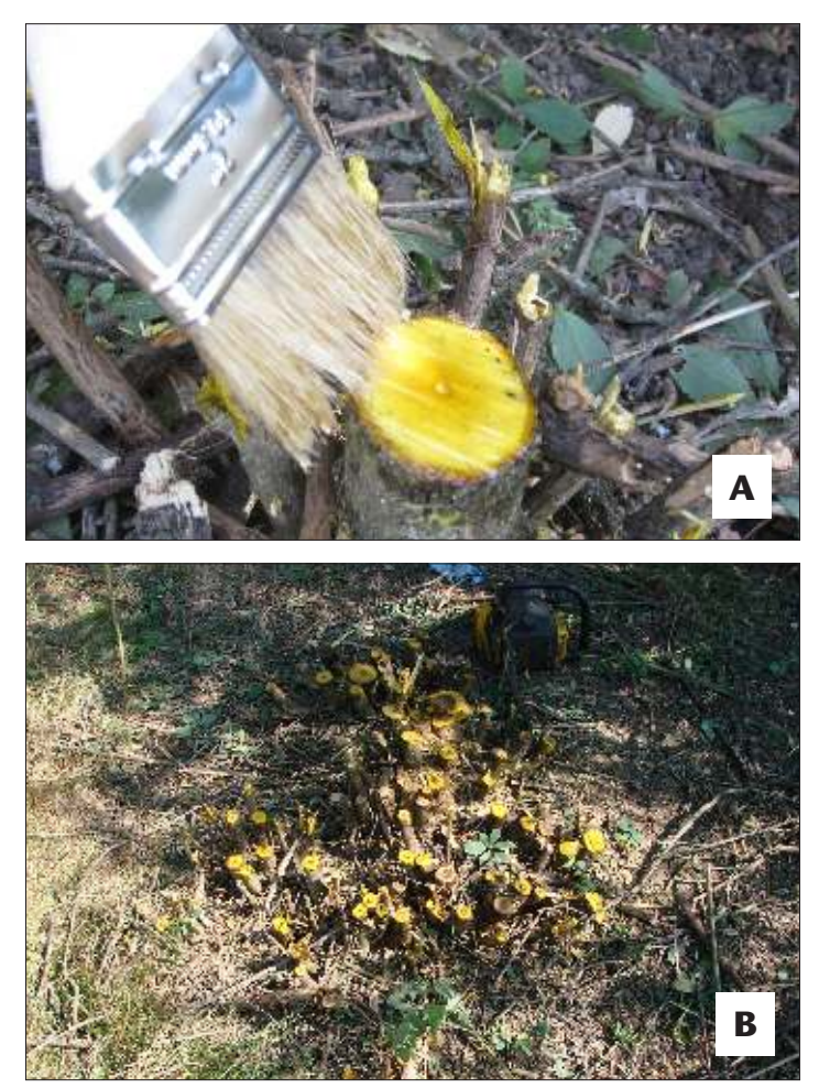
Figure 14. Barberry cut-stump treatments (A) paintbrush application to a stump; (B) stump cluster immediately after herbicide application.

Even though common barberry is not mandated for control in many states or counties, landowners should do their part to control this shrub to prevent the development of new races of stem rust.