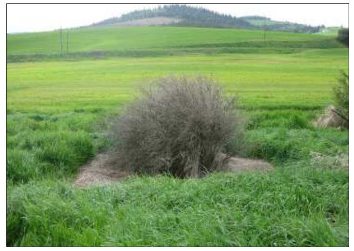
Figure 11. Barberry shrub after foliar herbicide application.

One entire uncut shrub located in an open area away from other shrubs and trees was treated with the foliar herbicidal spray imazapyr (Figure 11). The imazapyr was applied as a 2% solution (by volume) in water; a nonionic surfactant at 0.25% was also added prior to application. The herbicide was applied to all barberry foliage using a backpack sprayer. Imazapyr was selected for this foliar application because