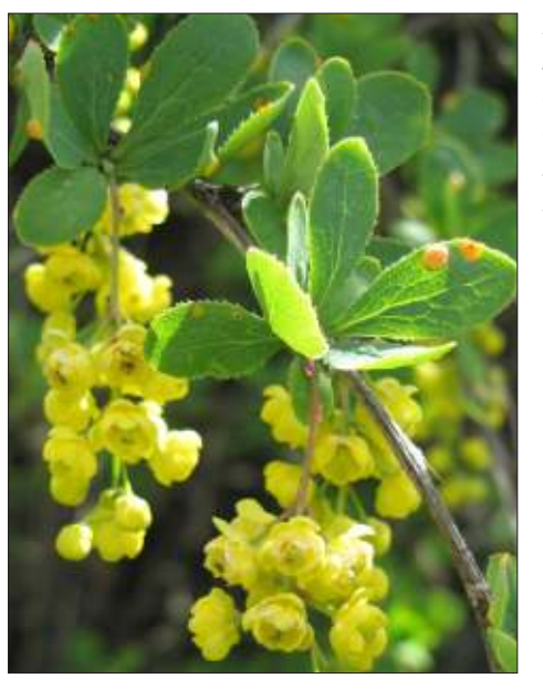
Figure 3. Common barberry flowers (May–June).