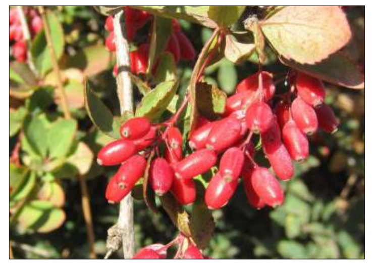
Figure 6. Barberry in the fall showing clusters of red berries.