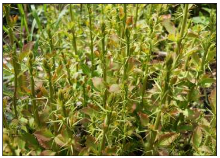
Figure 8. Barberry leaves are spiny-edged and have three spines at the base.