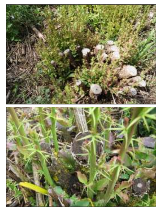
Figure 13. Barberry regrowth one year after cutting (no herbicide applied).

The six shrubs to receive cut-stump treatments were cut approximately 3 inches above the ground, and the cut surface of each stem was immediately treated with imazapyr, picloram, or a mixture of triclopyr + 2,4-D. Herbicides were mixed with crop oil concentrate (without water) at a rate of 100% (by volume), then applied to the stump using a paintbrush (Figure 14). Each stem was treated within a few minutes of cutting because herbicides become less effective if applied after the cut surface has dried.