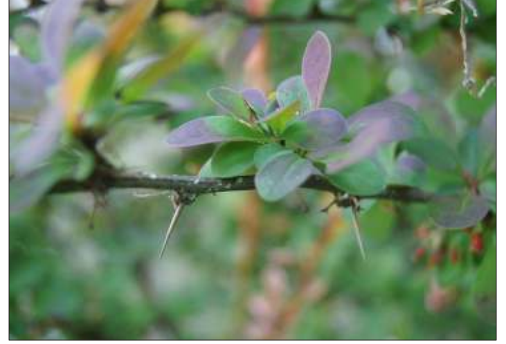
Figure 9. Japanese barberry showing smooth leaf edges and a single spine.