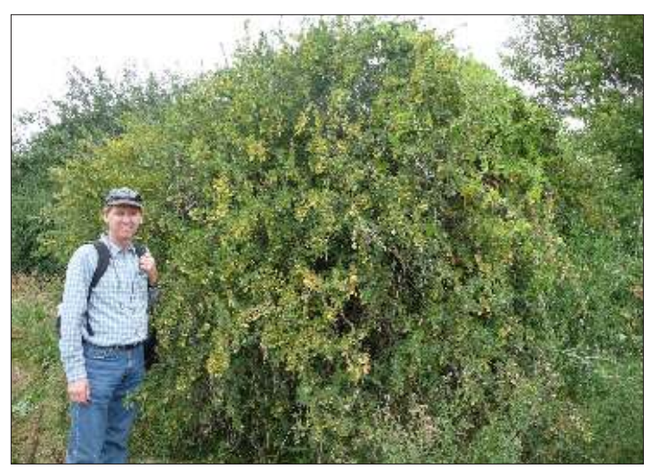
Figure 2. Large barberry bush in June.

The Japanese barberry, common in landscaping, has smooth-edged leaves with usually one spine at the leaf base (Figures 9 and 10). Barberry bushes that are purchased from nurseries today are Japanese barberry types ( Berberis thun bergii ). The Washington State Department of Agriculture inspects the Japanese barberry nursery stock to make sure it is resistant to stem rust.