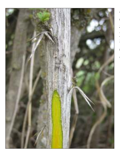
Figure 7. A barberry stem showing bright yellow wood and three spines at leaf bases.