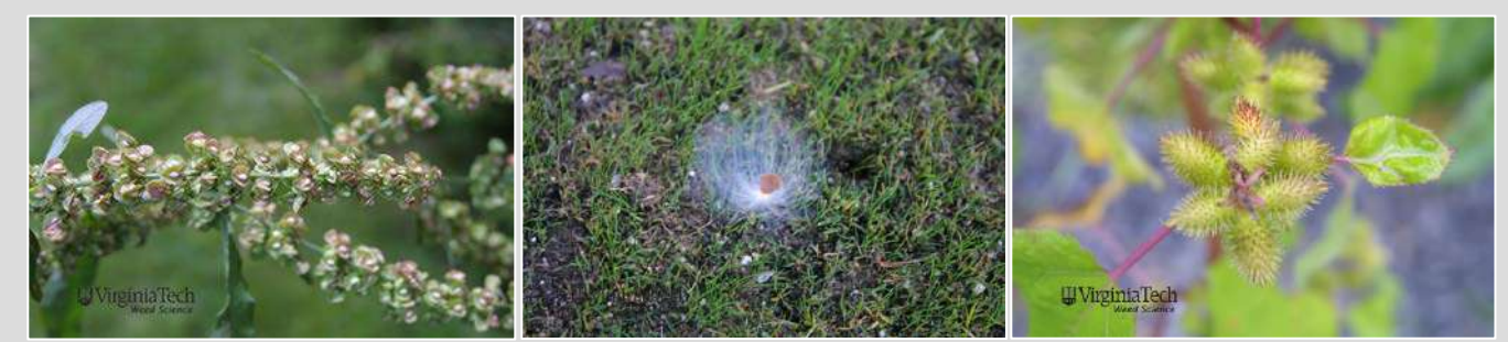
Photo 2.1 Seed adaptations for spread. Left: curly dock seed floats allowing dispersal on water; Center: common milkweed seed is adapted for dispersal by the wind; and Right: common cocklebur seed adapted for spread by clinging to animal fur or clothing (Photo credit: Virginia Tech, Weed Science).

Weed seeds spread by natural forces, such as wind and water, or by clinging to animals (Photo 2.1). Weed seed also can be spread by passing through the gut of animals. For example, Palmer amaranth can remain viable after passing through deer and has been found in the guts of 11 different bird species including migratory birds (DeVlaming and Vernon 1968; Farmer et al. 2017; Proctor 1968).