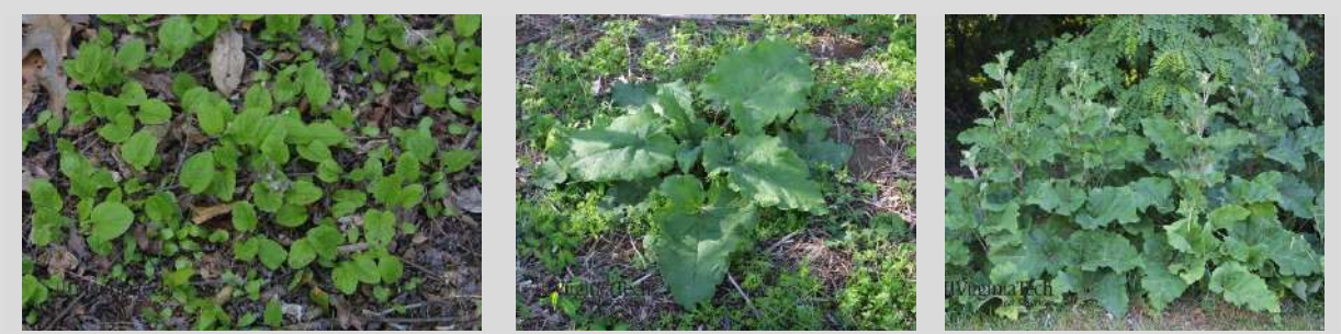
Seedling Rosette Mature Photo 2.4. Common burdock, a biennial weed, at various growth stages.

A biennial weed completes its life cycle in two years (Table 2.3). Germination and establishment occur in the first year and results in a rosette growth stage (Photo 2.4), which is the most effective time for most weed control tactics. In the second year, the weed flowers, produces seed, and dies. Biennials start each life cycle from seed and are most competitive in areas of infrequent management such as roadsides, pastures, or hayfields.