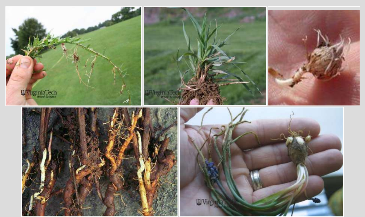
Photo 2.2. Perennial reproductive structures. Top left: stolons are aboveground horizontal stems that root at the buds (bermudagrass); top center: rhizomes are below ground thickened stems that grow horizontally near the soil surface (quackgrass); top right: tubers are starch storage structure at or below the soil surface that produce new shoots (yellow nutsedge); bottom left: thickened root adapted to spread and produce new stems (hemp dogbane); and bottom right: bulbs are modified leaf tissue located at the base of the stem and produce new shoots (grape hyacinth) (Yellow nutsedge photo credit: R. Prostak, Univ of Mass; all other photos Virginia Tech, Weed Science).

Unlike annual weeds, many perennial weeds possess special vegetative structures that allow them to reproduce without seed. These perennial structures contain food reserves and have numerous buds (meristem tissue) in which new plants can arise. Examples of these vegetative reproductive structures are shown in Photo 2.2.