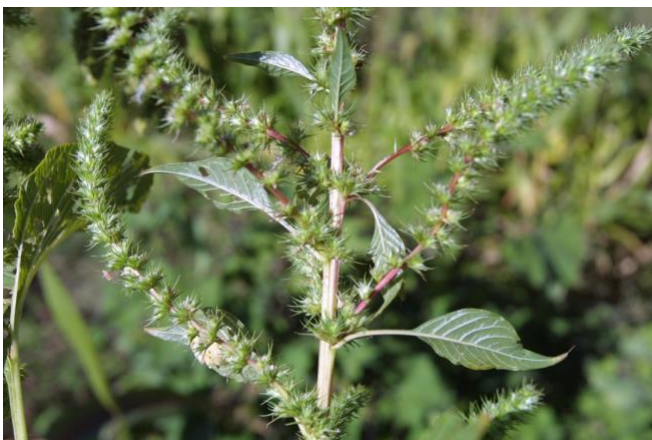
Figure 4. A female Palmer amaranth seed head.