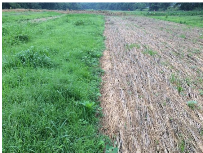
Figure 6. Comparison of weed control from no-cover (left) vs. fall-planted cereal rye cover (right) on June, 8 weeks after termination with glyphosate.

Cover crops are most effective for weed suppression (Figure 6) when high biomass levels (>7500 lbs dry biomass per acre) are achieved (Mirsky et al. 2011). To ensure high biomass levels, early planting of fall cover crops is crucial. Delayed cover crop termination can also help to increase biomass levels. Termination of cereal rye cover crop about May 1 typically maximizes biomass production. Greenhouse studies in Virginia have shown a 77% Palmer amaranth stand reduction from 9000 pounds per acre of cereal rye biomass (Rector and Flessner 2018).