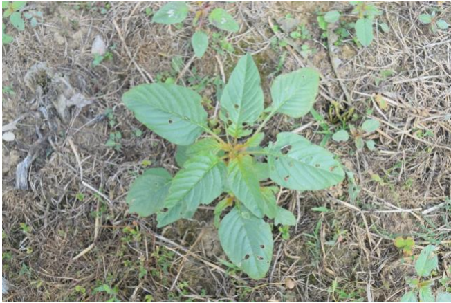
Figure 2. Palmer amaranth leaves are ovate to diamond shaped.