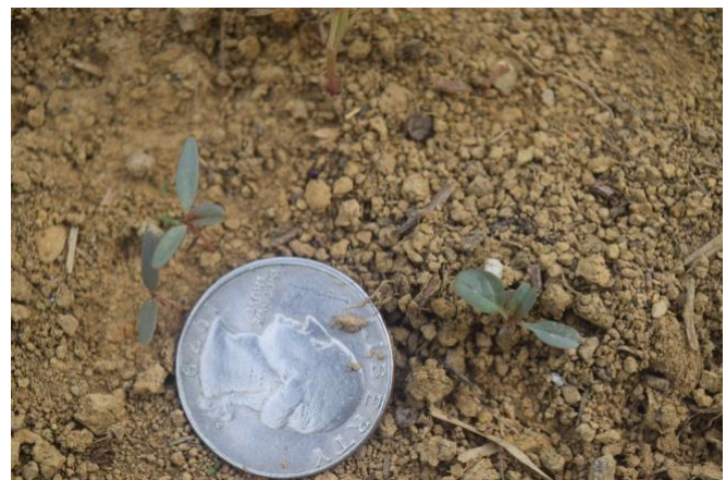
Figure 1. Palmer amaranth cotyledons.

Palmer amaranth cotyledons are linear to lanceolate in shape (Figure 1). Palmer amaranth can be differentiated from other pigweed species, such as redroot pigweed and spiny amaranth, by its lack of hair and long petiole length (Figures 2 & 3). Palmer amaranth bears separate female (Figure 4) and male flowers (Figure 5). Female flowers can be distinguished by their sharp bracts.