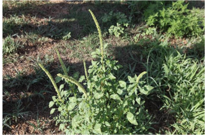
Figure 5. Male Palmer amaranth seed head.